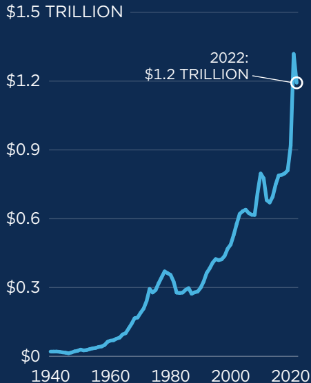
FEDERAL TRANSFERS TO STATE AND LOCAL GOVERNMENTS, IN 2023 DOLLARS